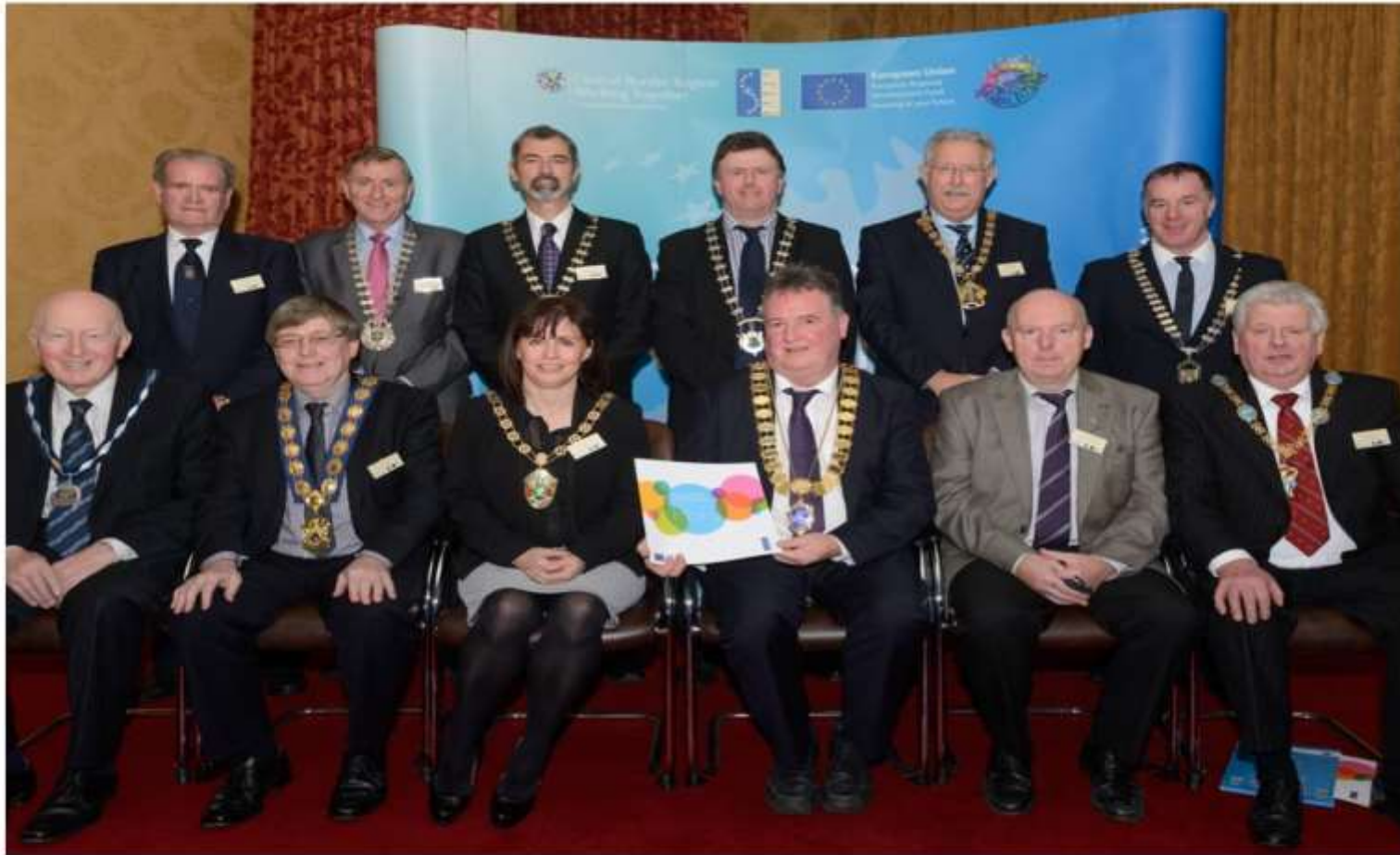
First Citizens of Councils of Central Border Region, 22/11/2013